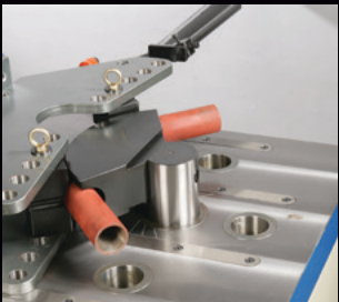
Tube, Pipe and Round Bar Bending