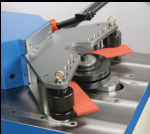
Flat -Bar Bending