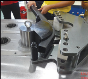
Custom Bending Tool