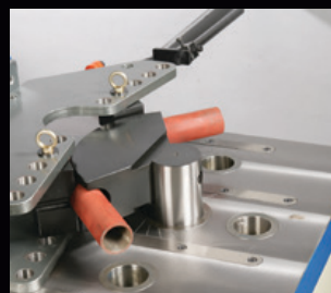
Tube, Pipe and Round Bar Bending